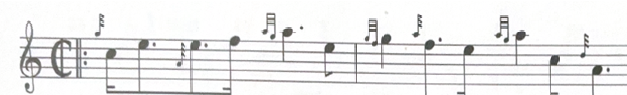
Video Example 1

Music for "High Road to Linton", cut time, evenly played beats *Can be used as music inside of a Reel Dance